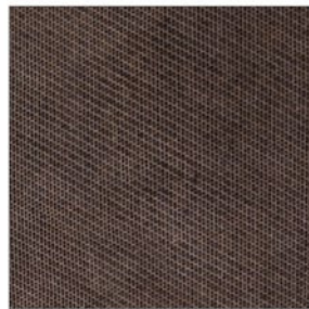
👍 Swiss Lace