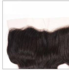
👍 Natural Hairline