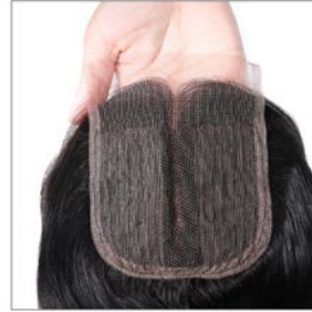
👍 Protective Band