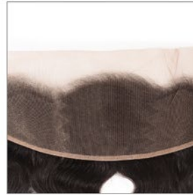
👍 Protective Band