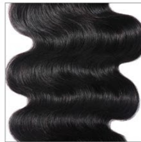
👍 100% Human Hair